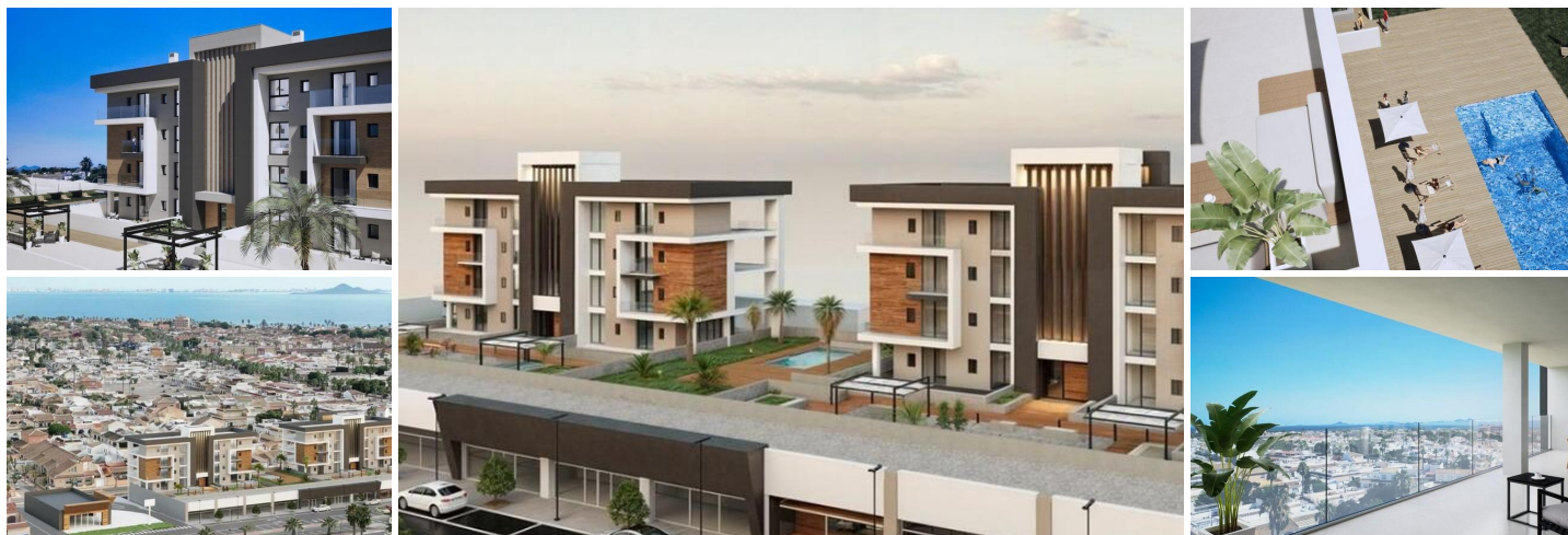
Tourist Apartments with Rental License in Los Narejos, Los Alcázares