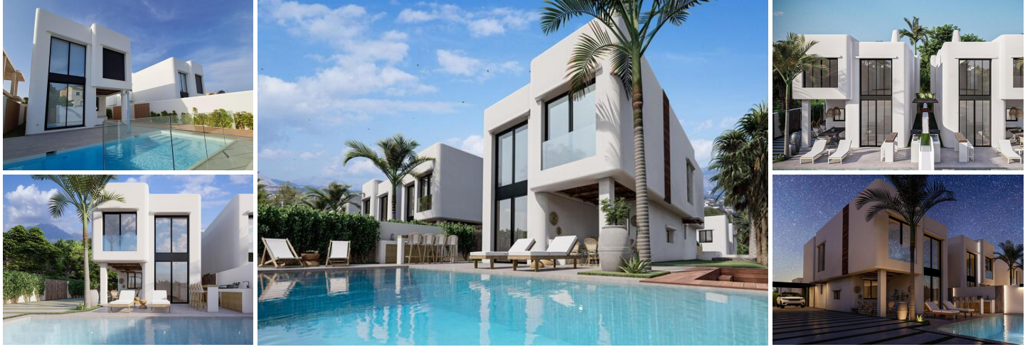
Exclusive New-Build Villas in El Albir – Mediterranean Lifestyle by Sierra Helada