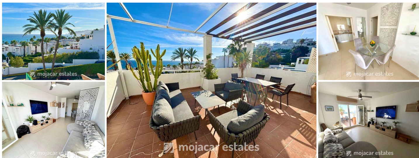
2-Bedroom Apartment with Sea Views – Oasis del Mar II, Mojácar Playa, Almeria

Spacious 2-bedroom, 2-bathroom apartment with sea views, located in the highly regarded Oasis del Mar II complex in Mojácar Playa, just 150 metres from the beach and a short walk to shops and restaurants.