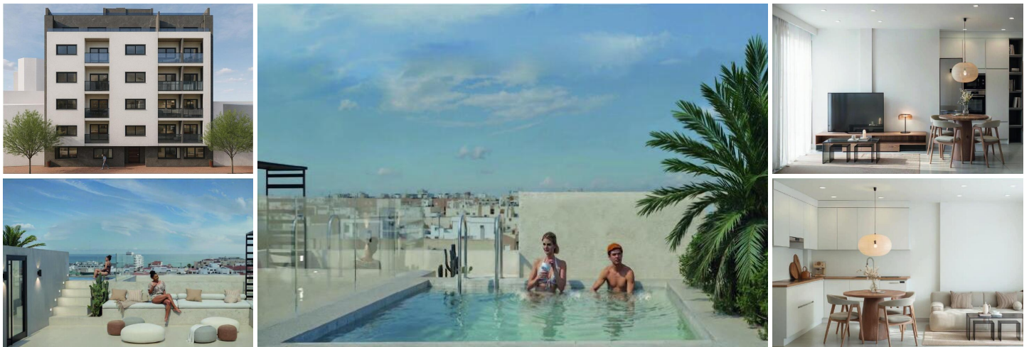
Modern Apartments for Sale Just 250 m from El Cura Beach in Torrevieja, Costa Blanca