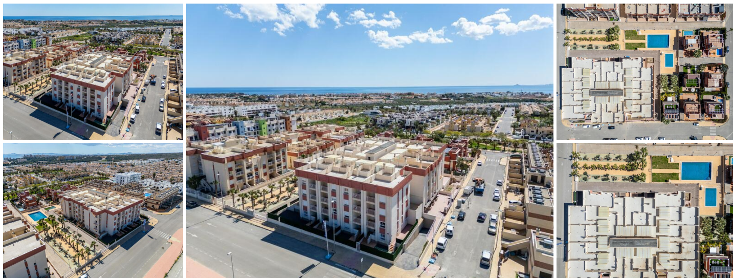
Regenerated Residential Complex in Lomas de Cabo Roig – Renovated Apartments