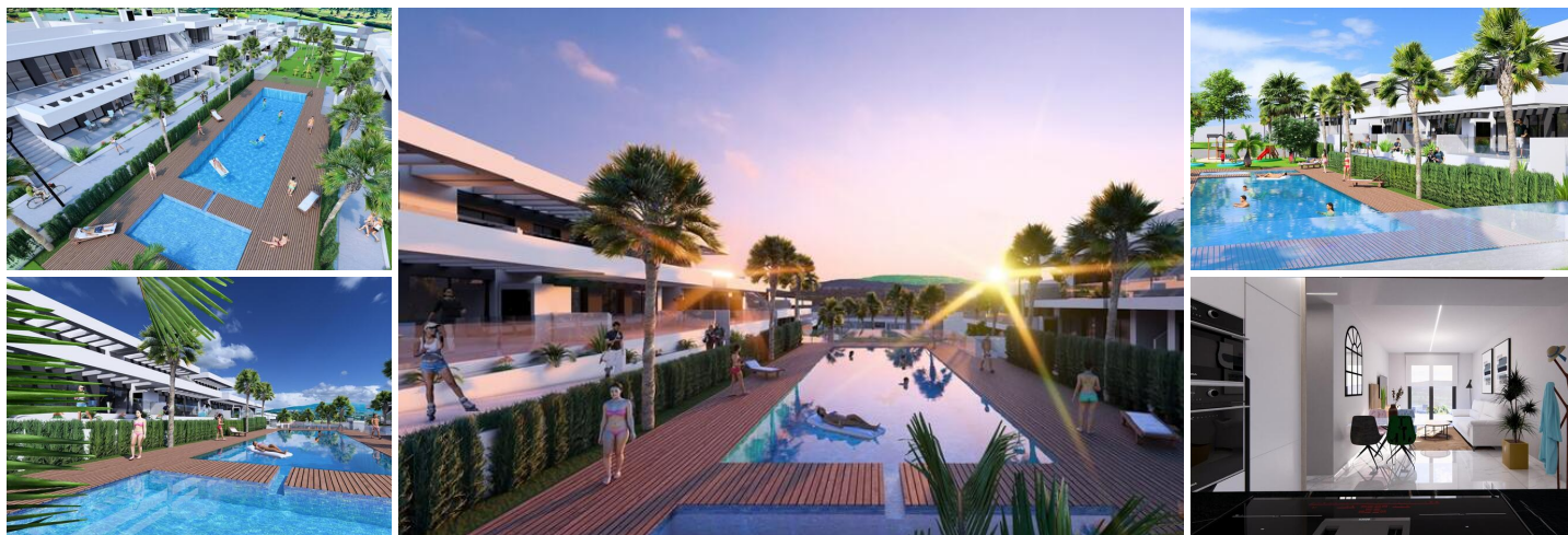
Exclusive New Construction Bungalows in La Finca Golf, Algorfa