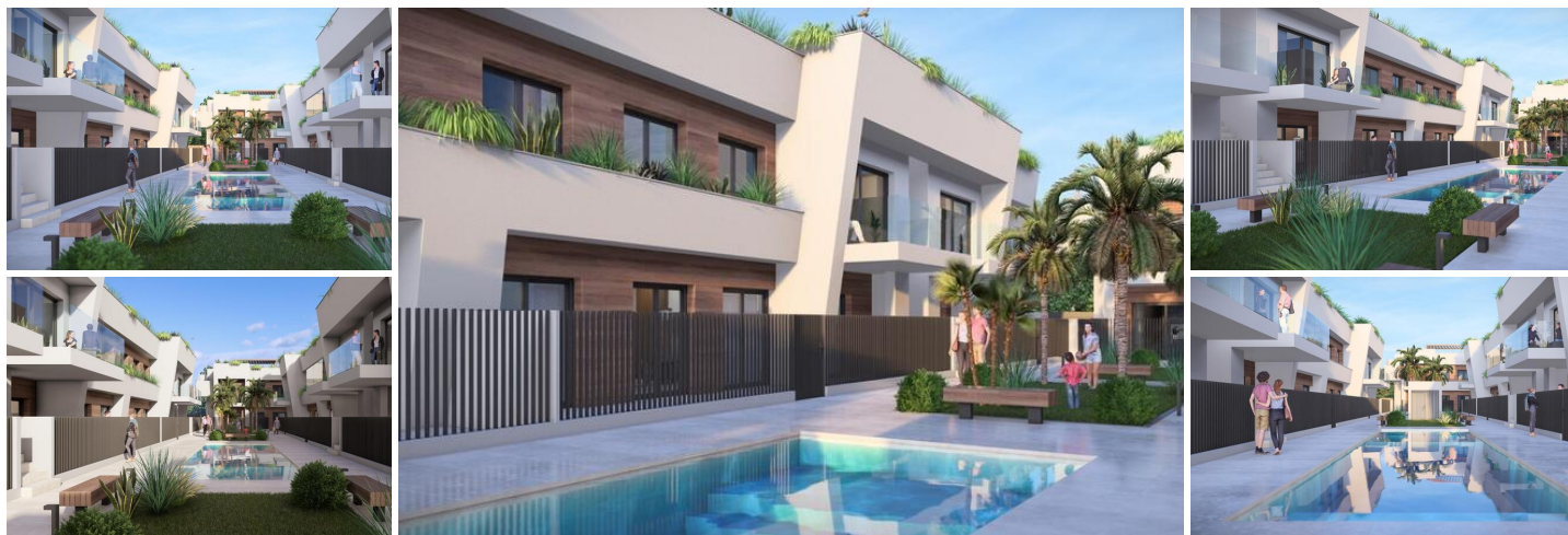
New Construction Homes in Torre-Pacheco, Costa Cálida