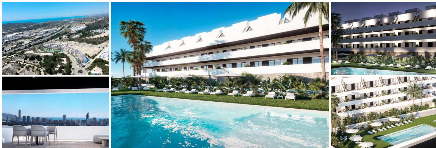
Exclusive New Build Residences with Sea Views in Finestrat, Alicante

Prime Location with Panoramic Views of Benidorm and the Mediterranean