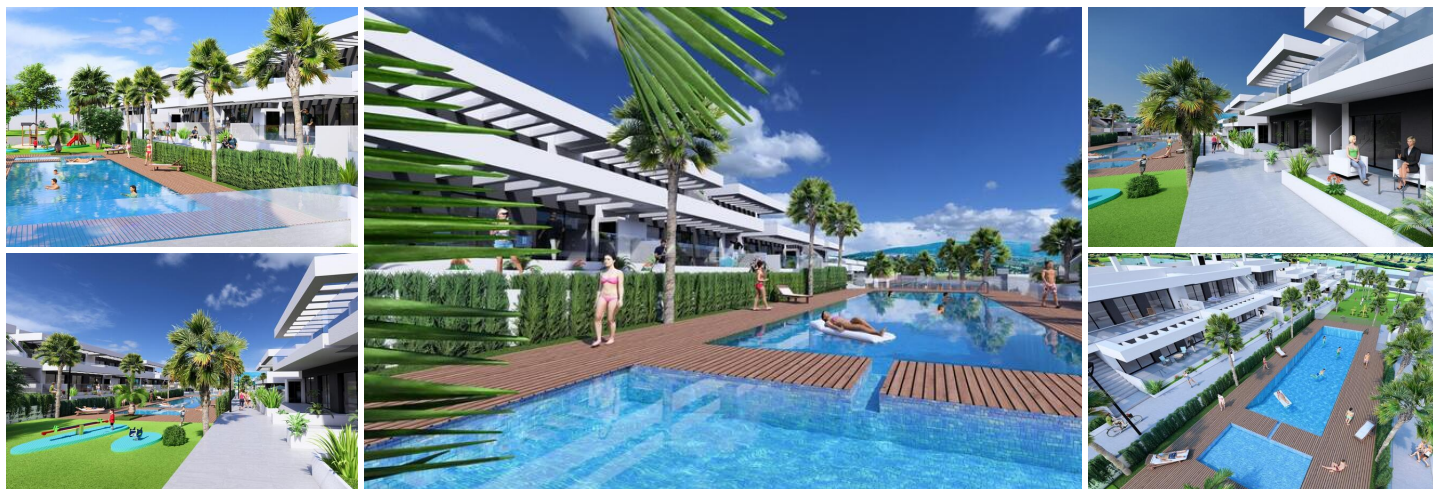
Exclusive New Construction Bungalows in La Finca Golf, Algorfa