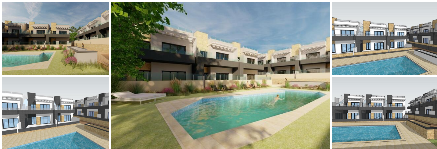
New Build Bungalows for Sale in Bigastro Modern Living on the Costa Blanca South