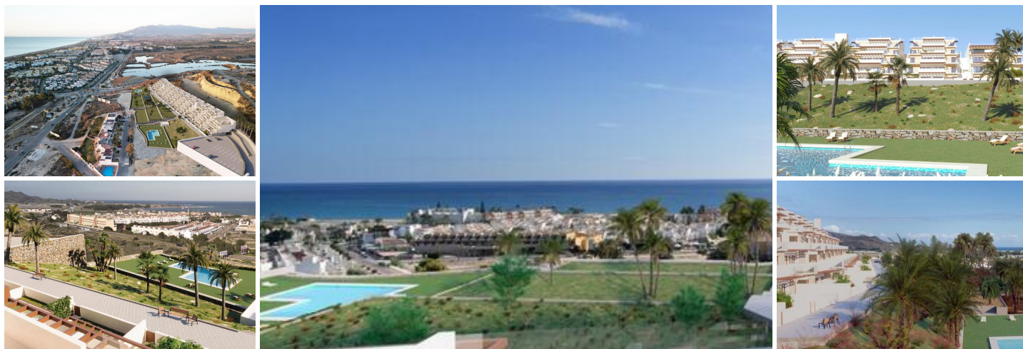
New Build Apartments with Sea Views in Vera Playa, Almería

Discover this exceptional new residential development in Vera Playa, offering 27 modern apartments in its first phase. Designed to combine comfort, functionality, and spectacular Mediterranean views, this project is ideal for those seeking a home on the Costa de Almería with style and convenience.