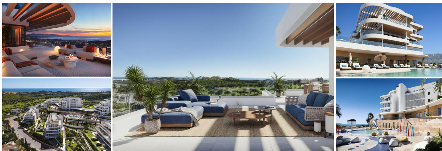
Luxury New Build Apartments in Cerrado del Águila Golf, Mijas with Sea and Golf Views

Experience an exclusive lifestyle in this modern new build resort located in the prestigious Cerrado del Águila Golf area of Mijas. Surrounded by nature and boasting panoramic 360° views of the Mediterranean Sea, mountain view and the golf course, this development offers the perfect combination of elegance, comfort, and convenience on the Costa del Sol.