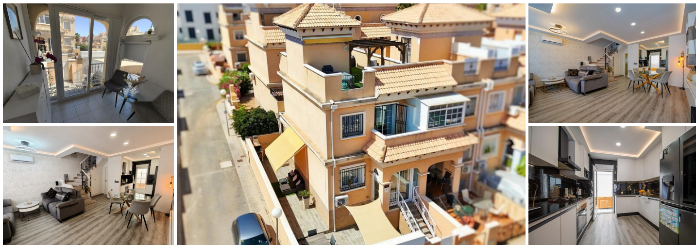
Beautifully Renovated 3-Bedroom Corner Townhouse with Solarium & Jacuzzi – Fully Furnished

This recently renovated 3-bedroom, 2-bathroom corner townhouse offers the perfect blend of comfort, style, and convenience. Set in a well-maintained community with a communal pool, the home is move-in ready and sold fully furnished – ideal for year-round living or a hassle-free holiday retreat.