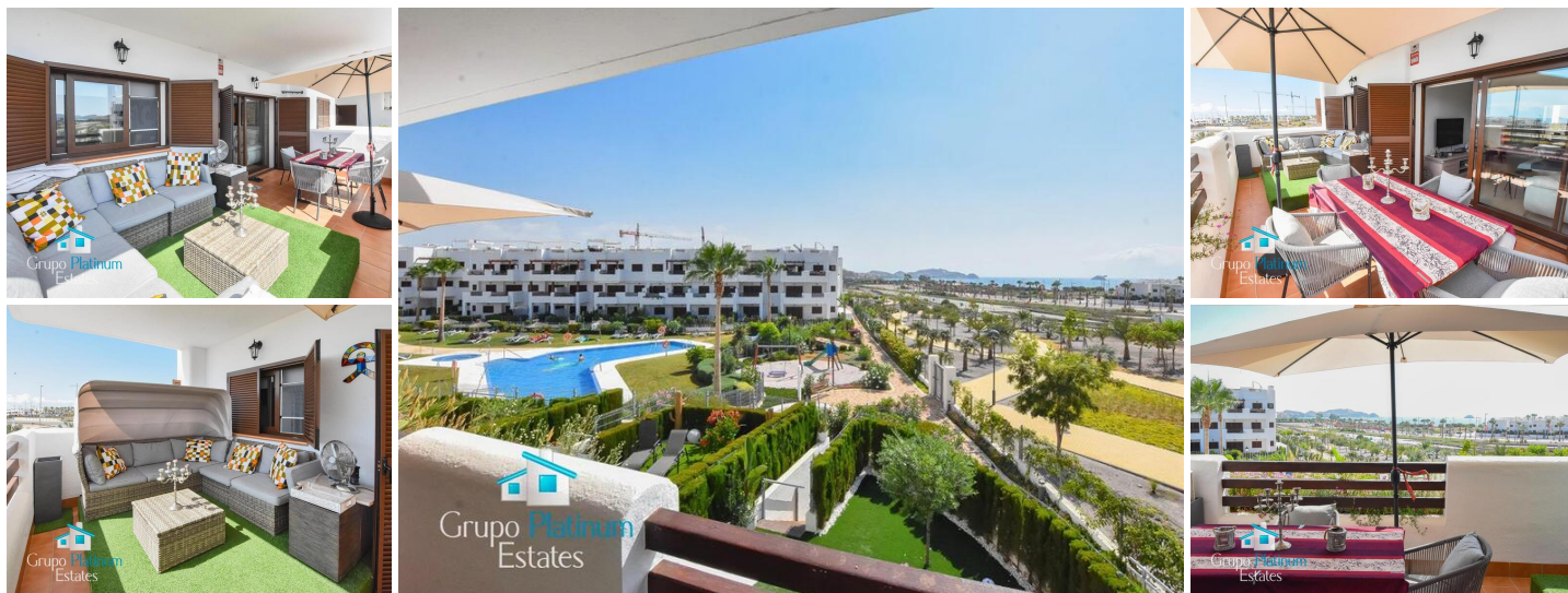
Stylish FirstFloor 3 Bedroom Apartment with Sea Views in Phase 7 of Mar de Pulpí

Experience Mediterranean living at its finest with this beautifully furnished and fully equipped first floor apartment, ideally located in the sought after Phase 7 of Mar de Pulpí, San Juan de los Terreros. Spanning 97 m 2 , this 3 bedroom, 2 bathroom residence offers the perfect blend of comfort, quality, and unbeatable sea views, all just a short stroll from the beach and local amenities. Step inside and be welcomed by a spacious, light filled living and dining area that opens directly onto a raised terrace. From here, you can take in sweeping views over the bay of San Juan de los Terreros a truly unique setting. The open plan kitchen is designed in a practical Lshape and has been thoughtfully upgraded with high spec appliances, an integrated wine bar, black marble finishes, and lacquered white furniture. A separate utility room houses the washing machine and provides additional storage.