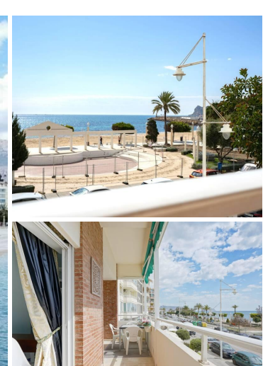
Front line beach apartment for sale in Altea,

This fantastic two bedroom flat is situated on the first floor of an apartment building in the beautiful Playa de la Roda in Altea. The flat offers beautiful sea views from the covered terrace and from the living room, the kitchen and the master bedroom. It has a total living area of 88 m2 and consists of a spacious living-dining room with open kitchen, a double bedroom, a bedroom with bathroom en suite, a separate bathroom and a laundry room. Thanks to the high ceilings, bunk beds can easily be placed in the bedrooms to create additional sleeping space. Both the living room and the master bedroom have direct access to the terrace through sliding windows. Thanks to the south-east orientation, you will enjoy plenty of natural light throughout the day. For extra comfort, the flat is equipped with air conditioning hot/cold and several storage rooms. The flat has been recently renovated, allowing you to move in immediately! There is also a lift in the building to ensure comfort.