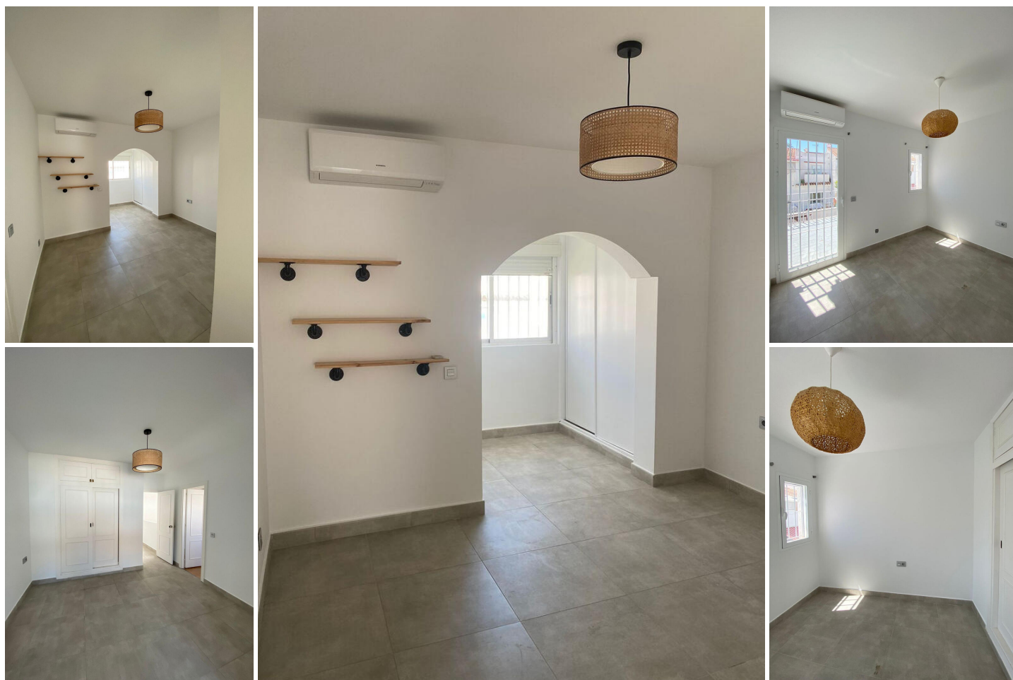
UNFURNISHED 3 BED TOWNHOUSE AVAILABLE FOR LONG TERM RENTAL

This beautiful townhouse is located in a charming Andalucian complex. With 3 bedrooms, it offers a comfortable and spacious living space. The ground floor features an open-concept layout with a living room, dining area, and kitchen. The cozy front terrace and south-facing backyard garden provide the perfect spots for relaxation. The property also boasts a communal pool and gardens, adding to the sense of community. The master bedroom comes with an ensuite bathroom, while the two additional bedrooms share a family bathroom.