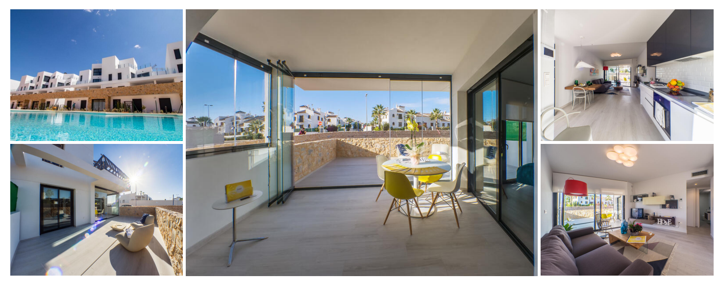
Last available 3 bedroom 2 bathroom second floor apartment!

Beautiful, spacious,luxury development in Villamartin, Alicante built by a prestigious developer. MANY EXTRAS AVAILABLE