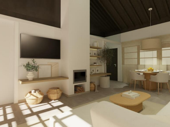
Elegant One-Level Townhouses with Private Pool in Peraleja Golf Resort - Costa Cálida

Mediterranean-Style Townhouses in a Gated Golf Community