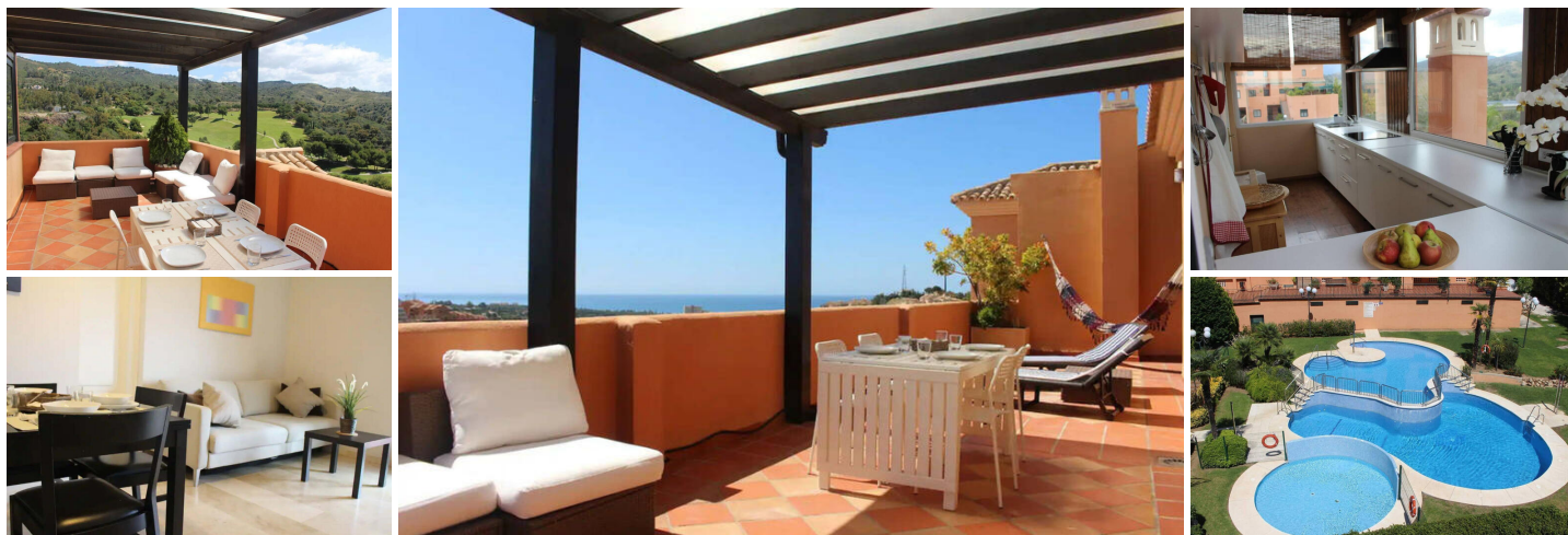
Charming One-Bedroom Penthouse with Panoramic Views in Elviria, Marbella

This fully independent one-bedroom penthouse, located in the tranquil hills of Elviria, Marbella, offers stunning panoramic views of the sea, mountains, and golf course. From the kitchen to the spacious terrace, every corner invites you to relax and soak in the sun, with total privacy and peace. Whether you're looking for the perfect holiday escape or a serene place to live year-round, this penthouse has it all.