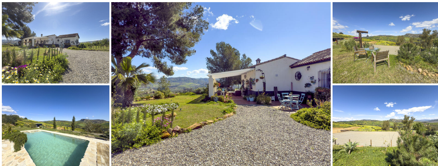
Equestrian Property with Breathtaking Mountain Views – Alora/Pizarra Area

Nestled in the picturesque countryside near Alora and Pizarra, this equestrian property offers a unique blend of comfort, functionality, and natural beauty. Set on approximately 20,000m 2 of fenced land, the estate is ideal for horse lovers, boasting stables, a schooling arena, and direct access to fantastic riding trails.