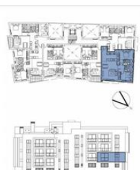
APARTAMENTO B 2 DORMITORIOS