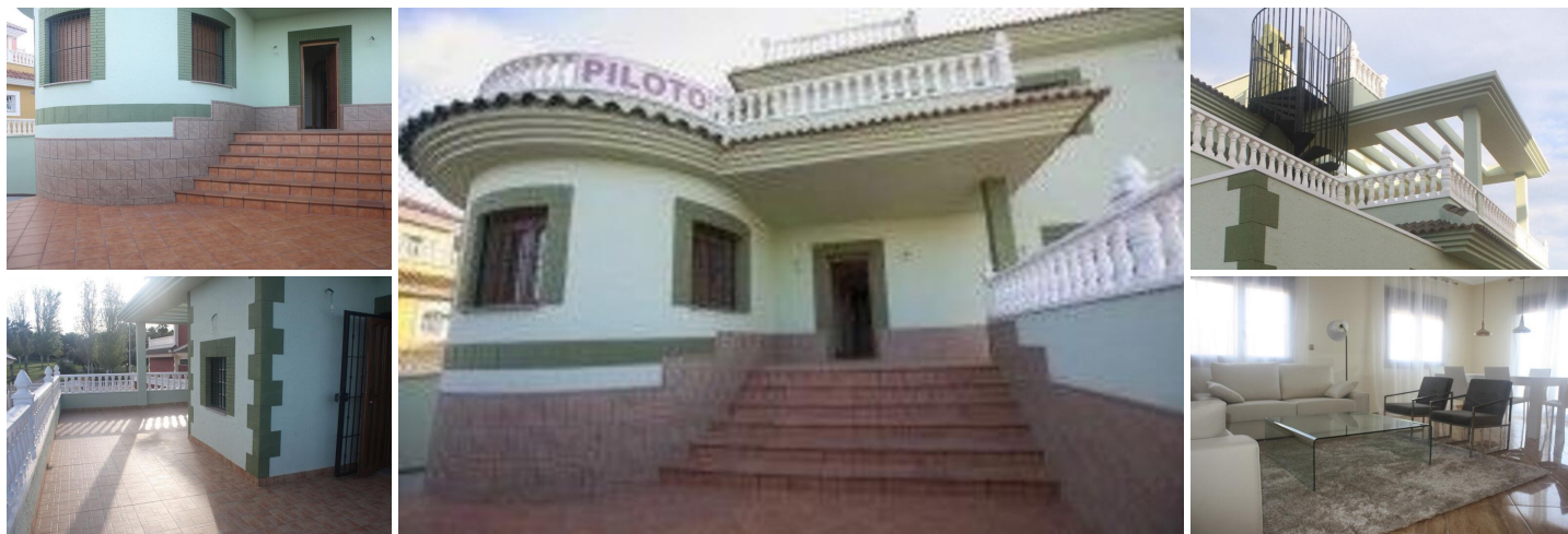
BEAUTIFUL VILLA IN LOS ALTOS, TORREVIEJA

Key Ready New villa in Los Altos located few minutes away from Hospital of Torrevieja and pink salt lake.