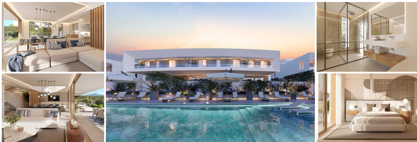
EL PARASIO / NEW GOLDEN MILE