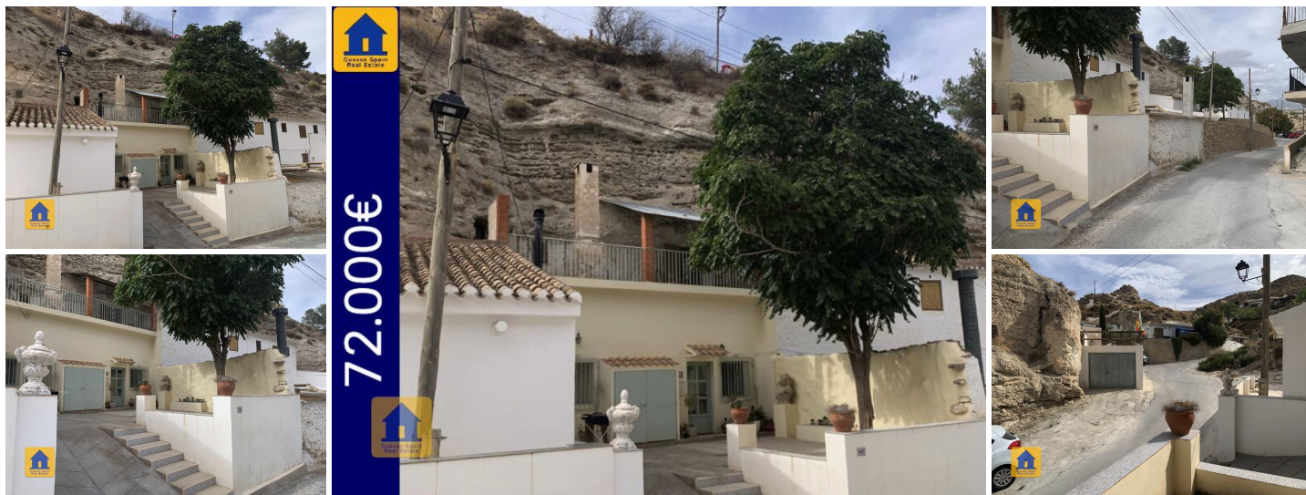
Cueva Tony in Galera

This Galera cave is beautifully renovated in a modern urban style. The property has a spacious patio with a shade tree and parking space. The cave has a living room, kitchen, pantry, master bedroom, bathroom, a guest room/office and a wardrobe. Upstairs are 2 unreformed rooms and a large covered terrace, with the potential to be a delightful apartment.