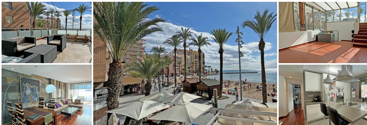
Exceptional Duplex Apartment with Sea Views at Playa del Cura

Discover coastal luxury in this unique duplex apartment, situated first line to the sea in Playa del Cura, offering uninterrupted ocean views and a private entrance directly from the street. This spacious 154 m 2 property is designed to blend comfort, style, and seaside elegance, making it perfect for families and those who appreciate spacious living by the sea.