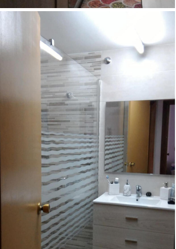
Top Floor Apartment, Fuengirola, Costa del Sol. 3 Bedrooms, 1 Bathroom, Built 110 m².

Condition: Excellent, Recently Renovated.