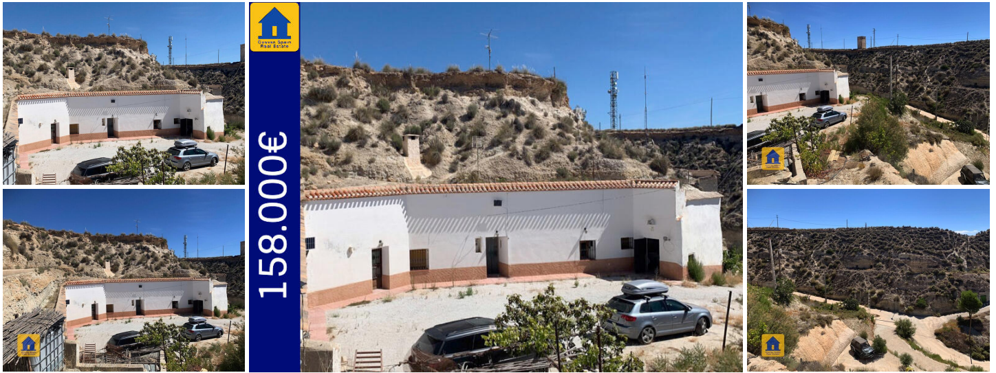
Cueva Angela in Los Carriones

Cueva Angela is a large unattached cave property in a stunning location. It is situated high up on the mountainside with views of the Badlands and the farmlands below. Access is via a gated, private track that leads up to a massive patio where you have the cave house, 2 garages/workshops and an additional cave tunnel. There are also 2 interconnected caves for reform. This property has great potential as a holiday home, permanent home or for a tourism business.