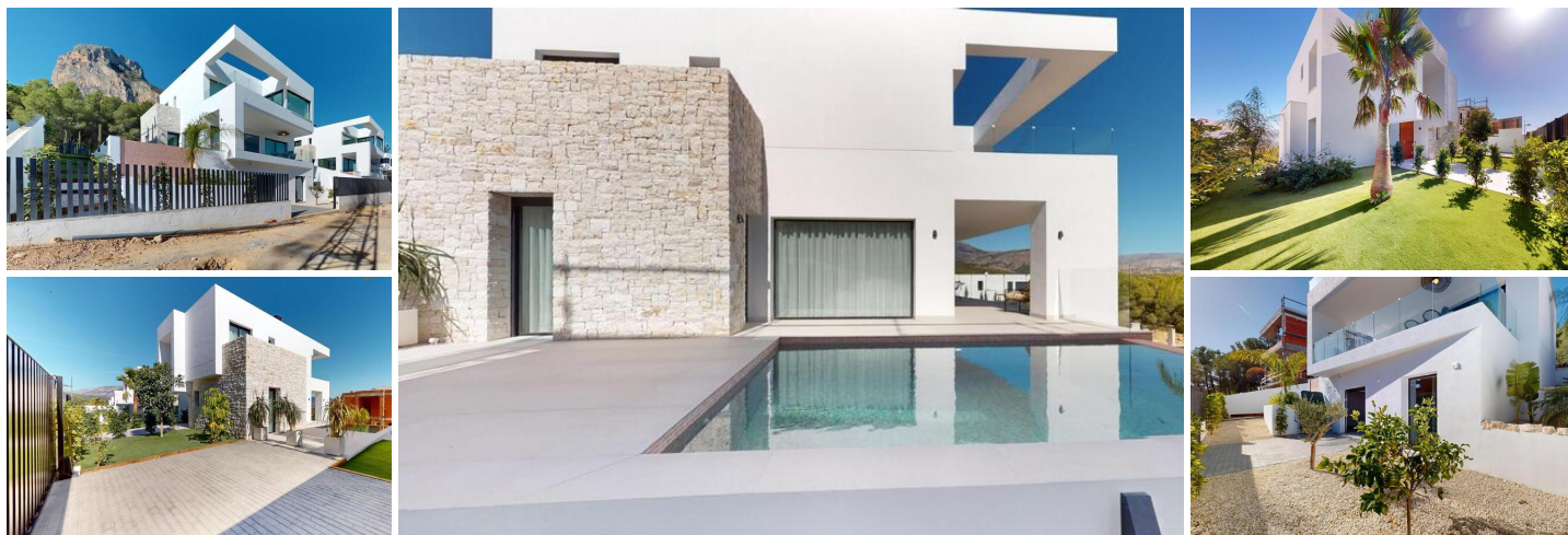
New Build Luxury Villas in Polop with Stunning Views Exclusive Development of 6 Luxury Villas in Polop

This brand-new promotion of 6 luxury villas is located in Polop, offering breathtaking views of the sea and mountains. Each villa is built on an independent plot with a private swimming pool, parking, barbecue area, and a spacious garden. The villas are spread over two floors plus a semi-basement, with a total of 293 m 2 on private plots of 393 m 2 .