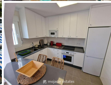
Las Cumbres Sca

Beautifully refurbished apartment with superb sea views and a short walk to beach and all amenities in the south end of Mojácar Playa.