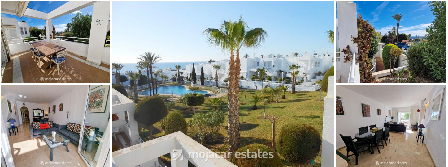
Parque Residencial Gri.

Beautiful ground floor apartment ( no steps for the purposes of access to apartment but is elevated one floor up from road) in frontline position residential complex next to Parque Comercial only 20mts to beach and very close to all shops and amenities.