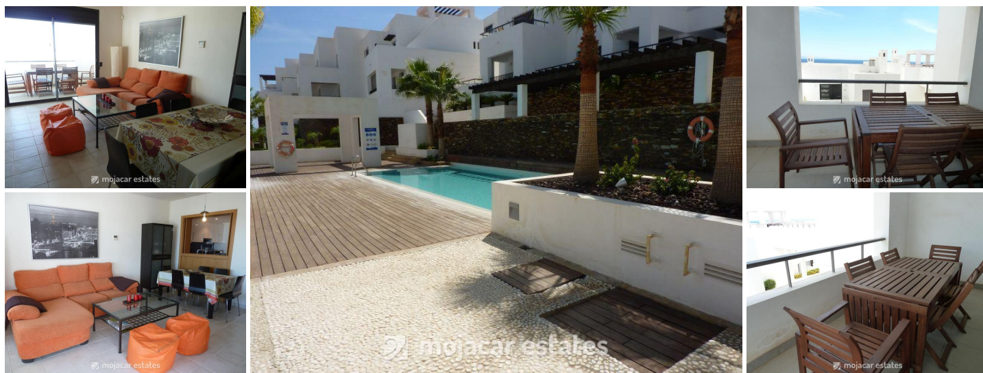
Casa El Marques

Lovely apartment for 6 people in an urbanization located on the outskirts of Mojácar with communal swimming pools and Macenas beach is in front of the urbanization.