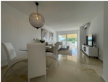
Long Term Rental available from September 2024 to April 2025

Top floor 2 bed 2 bath apartment in a gated complex with stunning communal gardens and 2 pools. Located in El Paraiso walking distance to all facilities. The property has been reformed to a good standard, apart from one bathroom, very spacious full of natural light, with a fantastic South facing terrace. On Entrance you have the feeling of a bright good space with semi open plan living, the kitchen is to the rear of the property with dining and living area in front leading out onto the terrace overlooking the communal pool. Master bedroom with En Suite and walk in wardrobe to the front of the property. Guest bedroom with family bathroom next door. Also a utility room. The apartment has plenty of space and storage. Please note there is a small amount of road noise.