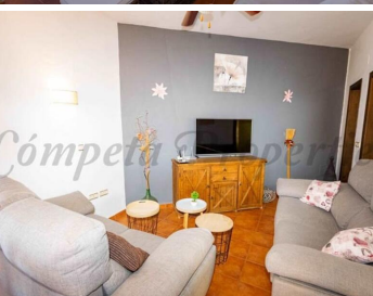
Only winter rental available.

This lovely country property is located just less than 5 minutes drive from the white village of Torrox. Due to its great access and proximity to the village it can be ideal to enjoy a relaxing and tranquil vacation.