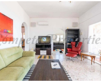
Available from october to march.

A stunning villa with a private swimming pool in Spain situated in one of the white villages of the Axarquía and only a few minutes' drive from the pretty village of Torrox and about twenty minutes from the beaches of the Costa del Sol.