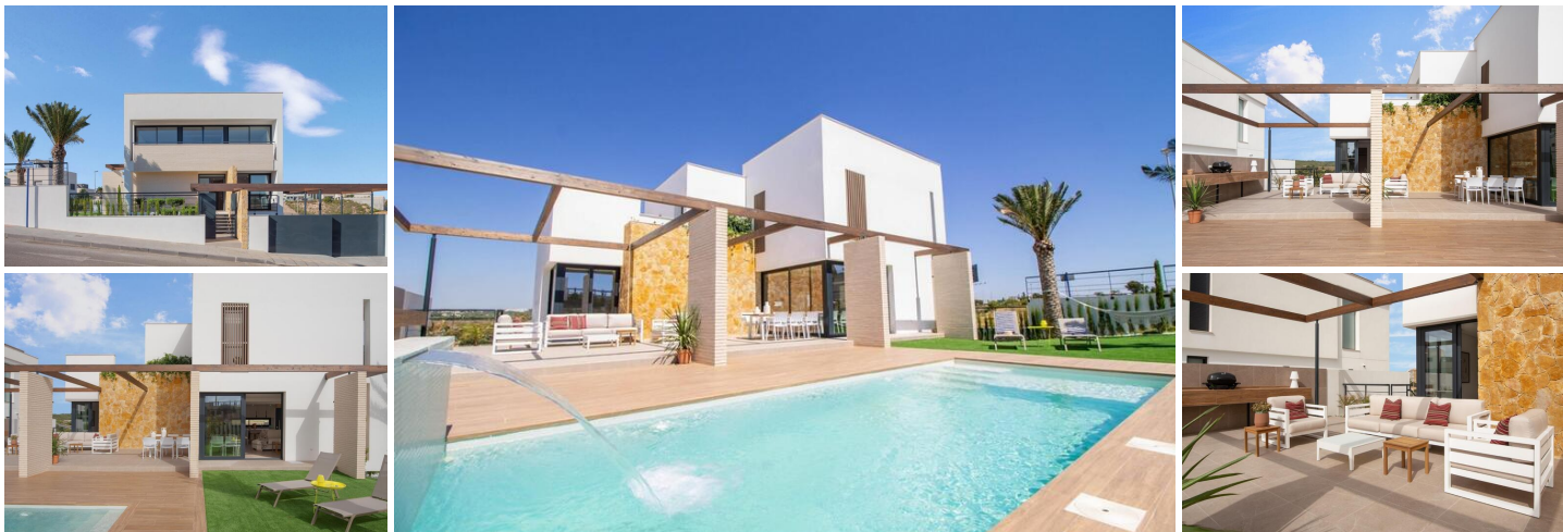
LUXURY VILLA ON THE BEACH

A 2 minute walk from the beach and the possibility of enjoying more than 300 days of sunshine a year with an average temperature of 20° C !!!