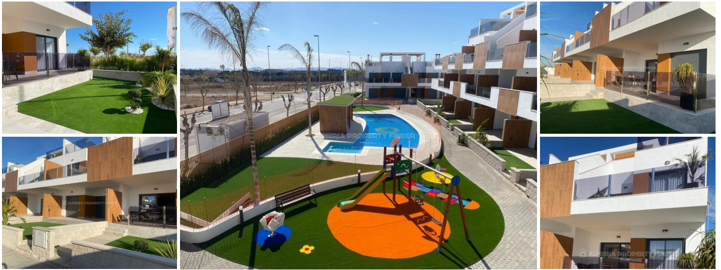
Lamar Resort Vii A7-b1 - An apartment in the Pilar de la Horadada area. (Newly Built)

LAMAR Resort Luxury VII is a luxury project of 34 apartments with 2/3 bedrooms and 2 bathrooms divided into 3 blocks with communal swimming pool, jacuzzi, gym, playground and garage with storage room. The ground floor apartments have large gardens, the first floor has terraces and the penthouses have a solarium with jacuzzi. The facades of these buildings are clad with high-quality ceramic tiles combined with a white dirt-resistant monolayer.