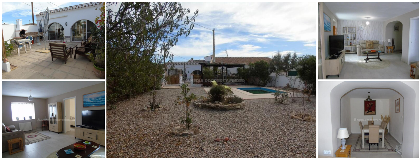
Cortijo Alma - A country house in the Albox area. (Resale)

A beautiful semi detached country property with four bedrooms, two bathrooms and a build of 197m 2 . The property is located in the pretty village of Las Pocicas which has amenities for daily living such as a shop, bars and a restaurant, the larger market town of Albox is approximately a 10 minute drive away which offers all amenities including a wide variety of shops, supermarkets, banks, post office, tapas bars, cafes, restaurants, 24 hour medical centre, sports facilities and two weekly markets.