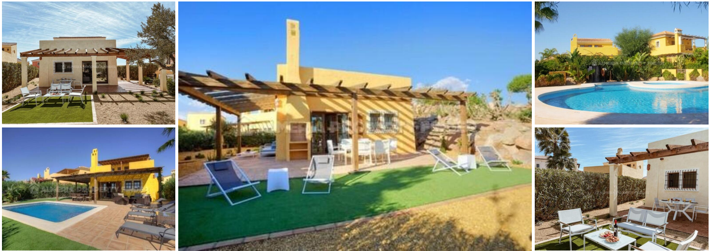
Desert Spring Gold I 12 - A town house in the Cuevas del Almanzora area. (Newly Built)

HOMES WITH MODERN APPEAL REFLECTING THE HERITAGE OF TRADITION WHILST OFFERING A STYLISH CONTEMPORARY FEEL