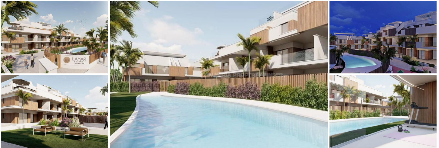
Lamar Resort VII A25-B3 - An apartment in the Pilar de la Horadada area. (Newly Built)

LAMAR Resort Luxury VII is a luxury project of 34 apartments with 2/3 bedrooms and 2 bathrooms divided into 3 blocks with communal swimming pool, jacuzzi, gym, playground and garage with storage room. The ground floor apartments have large gardens, the first floor has terraces and the penthouses have a solarium with jacuzzi. The facades of these buildings are clad with high-quality ceramic tiles combined with a white dirt-resistant monolayer.