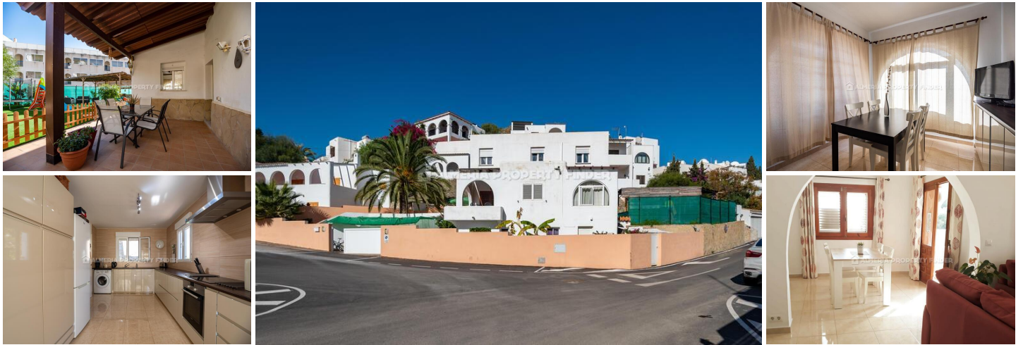
Villa Shenika III - A villa in the Mojácar area. (Resale)

Casa Limon: 100m from the beach this detached property has been completely transformed by the current owners. Purchased from Price Brown in 2012 the time an effort put into this property is apparent. The fully walled plot has an area suitable for parking two cars and is accessed via electric gates. Part of the garden is grassed with an entertainment area and pergola. The property comprises on the ground floor; entrance hallway, living room with fireplace, air conditioning and doors to a sea facing terrace, good sized kitchen and dining room, bedroom with built in wardrobes and air conditioning and a shower room. Stairs lead from the entrance hallway to the first floor with the master bedroom with built in wardrobes and en-suite bathroom, and two further double bedrooms with air conditioning and built in wardrobes and the large family bathroom. In essence this is a well located detached property close to some of the best beaches in Mojácar.