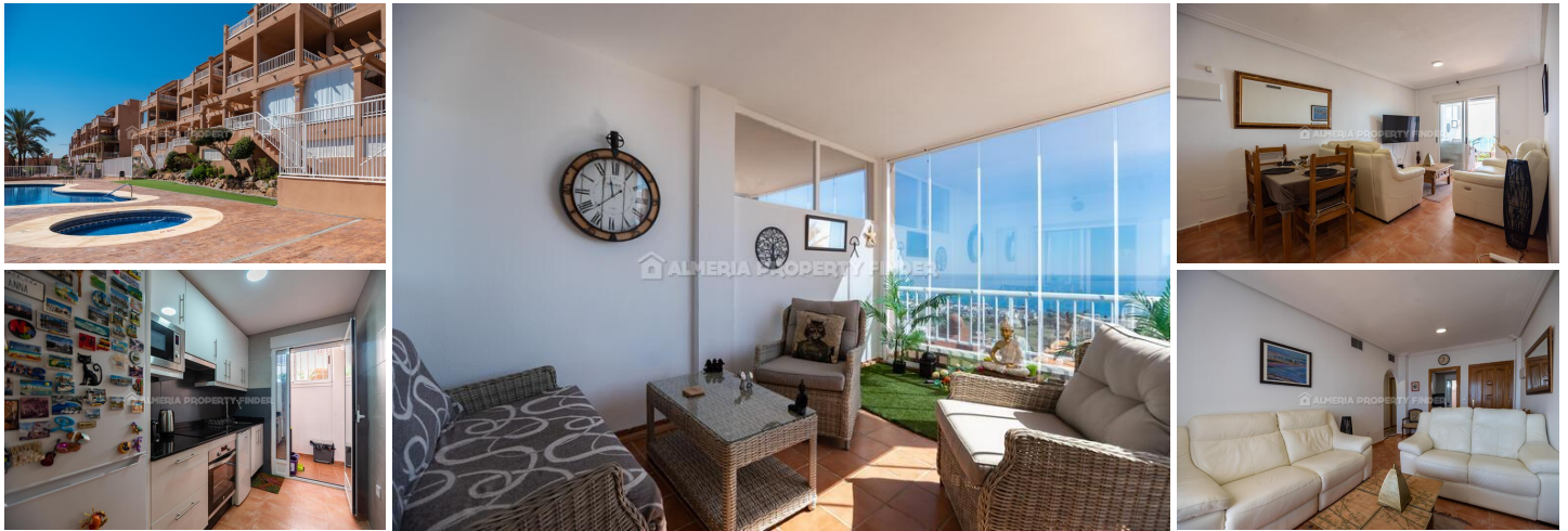
Apartment Carlotta II - An apartment in the Mojácar Playa area. (Resale)

Marina de la Torre: Superbly presented 3 bed apartment with the most incredible sea views. The property has been completely renovated with new bathrooms, new kitchen and the addition of a terrace with glass curtains. The complex has low community fees and two swimming pools. It is a first floor apartment but you can gain access via a communal walk way without negotiating any steps. It comprises bright and airy living room with access to the terrace, galley style kitchen with utility off, principal bedroom with sea views and built in wardrobes, en-suite shower room, two further double bedrooms and the family bathroom. One of the bedrooms has been fitted out with a bank of wardrobes which can easily be removed.