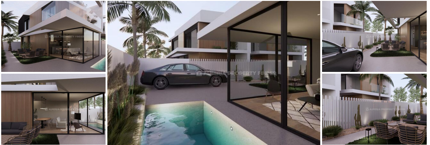
Ottawa Luxury Villa 3C - A villa in the Torre de la Horadada area. (Newly Built)

OTTAWA LUXURY VILLAS is a luxury project of 4 villas on independent plots with individual swimming pools and solariums on the upper floors. Located in La Torre de la Horadada (Alicante).