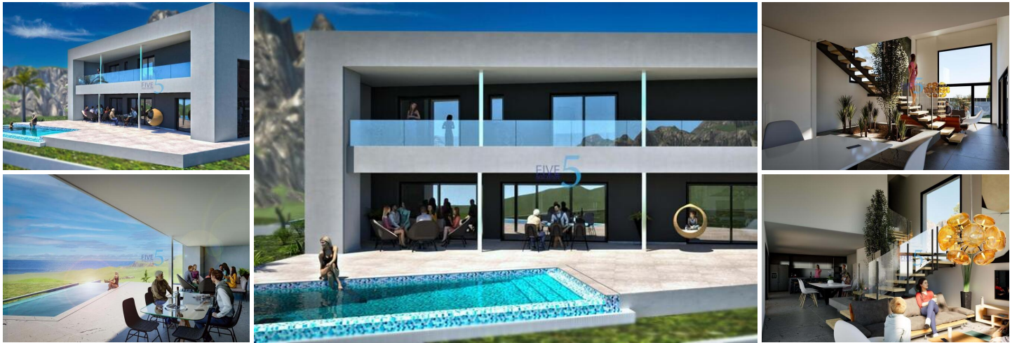
NEW BUILD VILLA IN LA NUCIA

Wonderful contemporary style villa with views to the sea and mountain in La Nucía, close to Panorama area and near the Elian's british school.