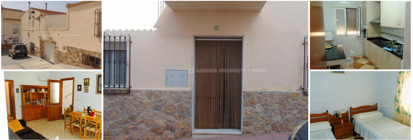
Casa San José - A village house in the Partalóa area. (Renovated)

Village house with 264 m 2 built surface, 200 m 2 plot area, 5 bedrooms, 3 bathrooms, 3 toilets, 3 equipped kitchens, 4 living rooms, entrance hall, 2 stoves, wood fuel, fireplace, 1 garage, 1 terrace, 1 balcony, 1 storage room, air conditioning, shutters, fly screens, hot water central - electric.