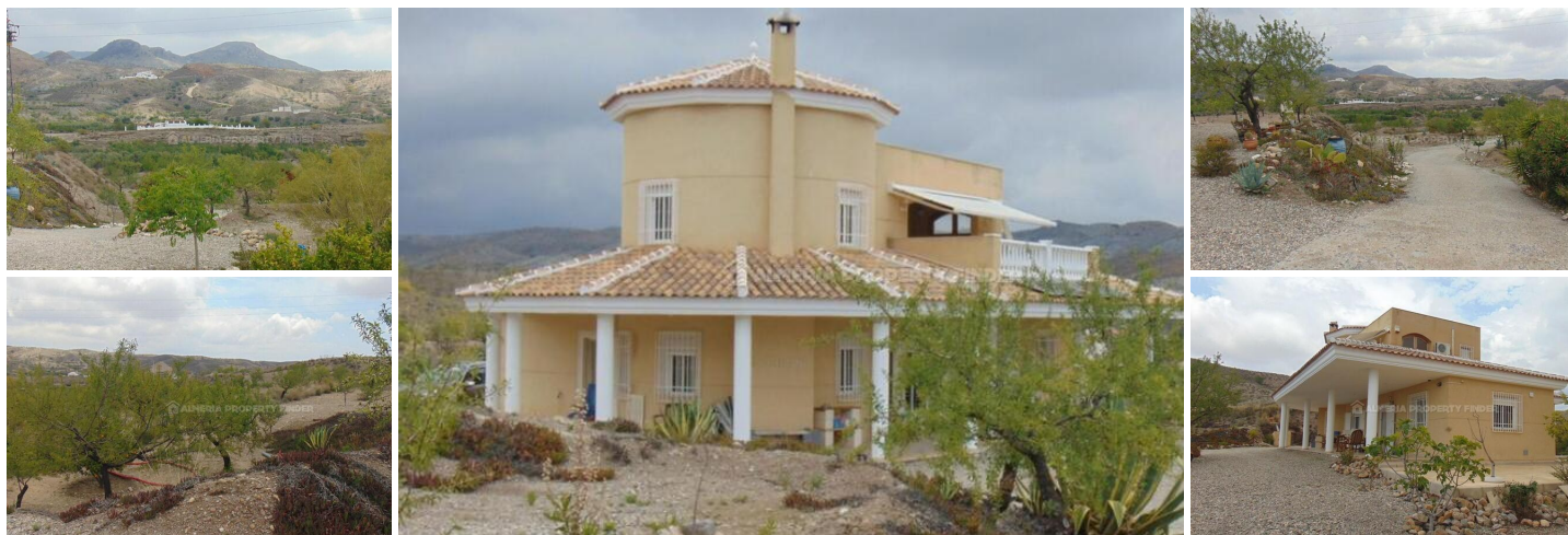
Villa La Pacarina - A villa in the Las Pocicas area. (Resale)

Villa with 253 m 2 built, 15,356 m 2 plot area, 3 bedrooms, 2 bathrooms, 3 toilets, very good condition, 2 terraces, kitchen with household appliances, unfurnished, 2 floors, double garage, parking, camper pitch, jacuzzi, water tank, water rights, air conditioning ( warm/cold ), solar panels, alarm center, surveillance cameras, shutters, security doors, high efficiency wood stove heating, hot water with gas and electric, solar panels, marble flooring.