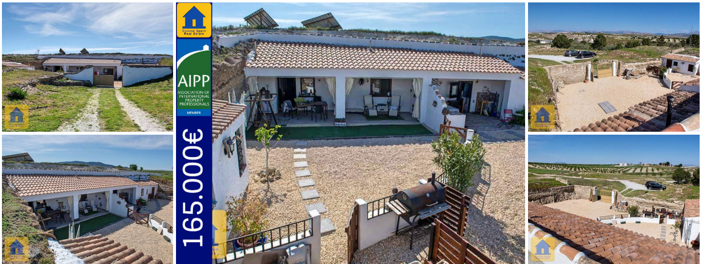
Cueva Michelle La Alqueria

This is a recently totally refurbished very cavy cave house (just finished this month) with nicely shaped and curved walls, it sits all alone in it's own little mountain, on the edge of the village La Alqueria. No Neighbours, and fantastic 360° views. Off the grid, with a brand new modern large enough solar system 5 Kw plus generator back up. No bills for electricity. Drinking-water is connected and a large septic tank.