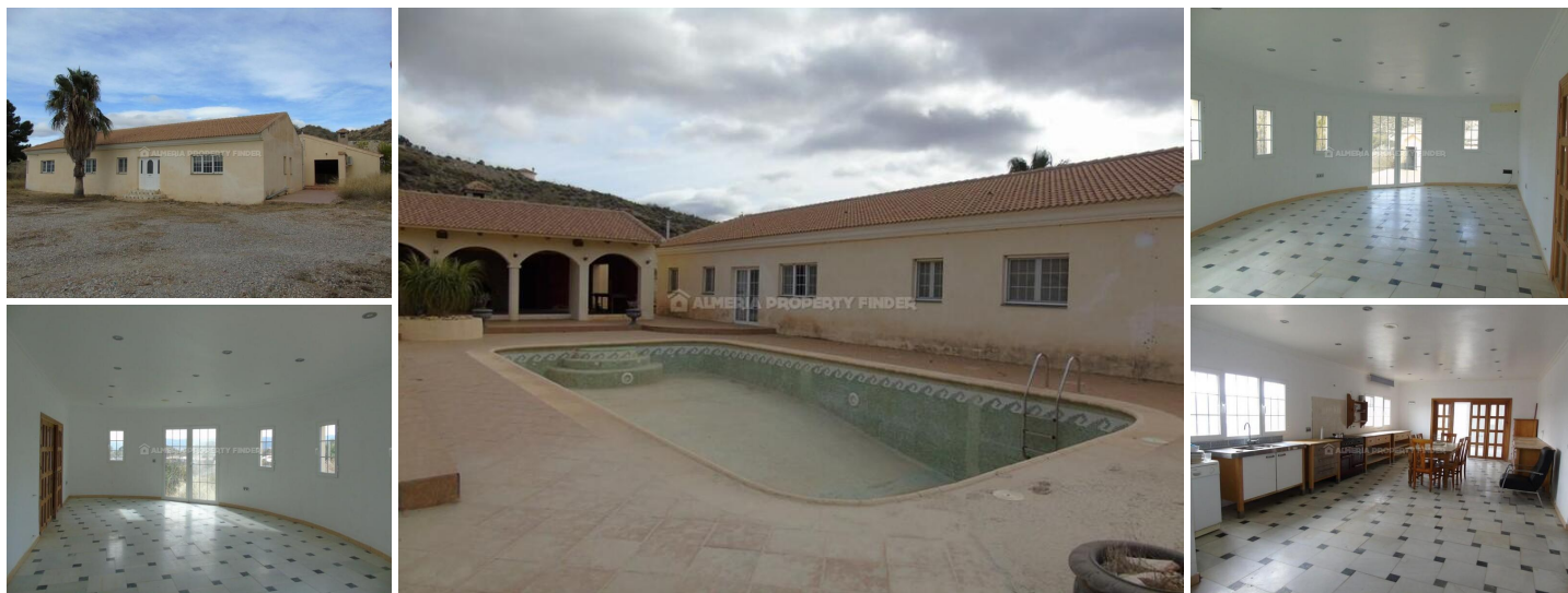
Villa Nova - A villa in the Partalooa area. (Resale)

!!! EXCLUSIVE TO ALMERIA PROEPTY FINDER !!!