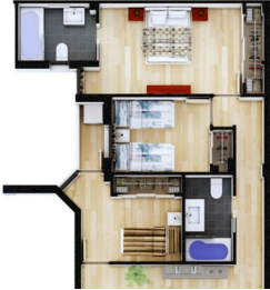
CUBIERTA CON TERRAZAS