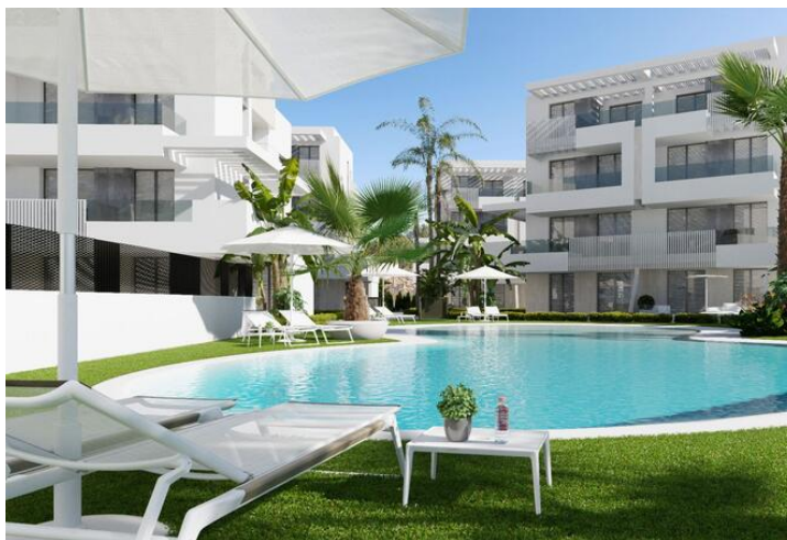
PERSPECTIVA LATERAL FACHADA PRINCIPAL