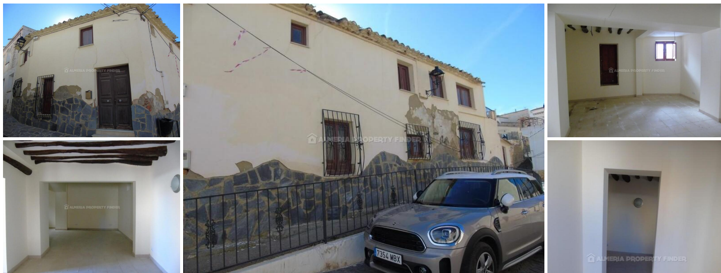
Casa Huertos - A village house in the Purchena area. (Partially Reformed)

Large 3 bedroom, 3 bathroom village house with a 1 bedroom, 1 bathroom guest annexe, situated in the charming village of Sufli in the municipality of Purchena.